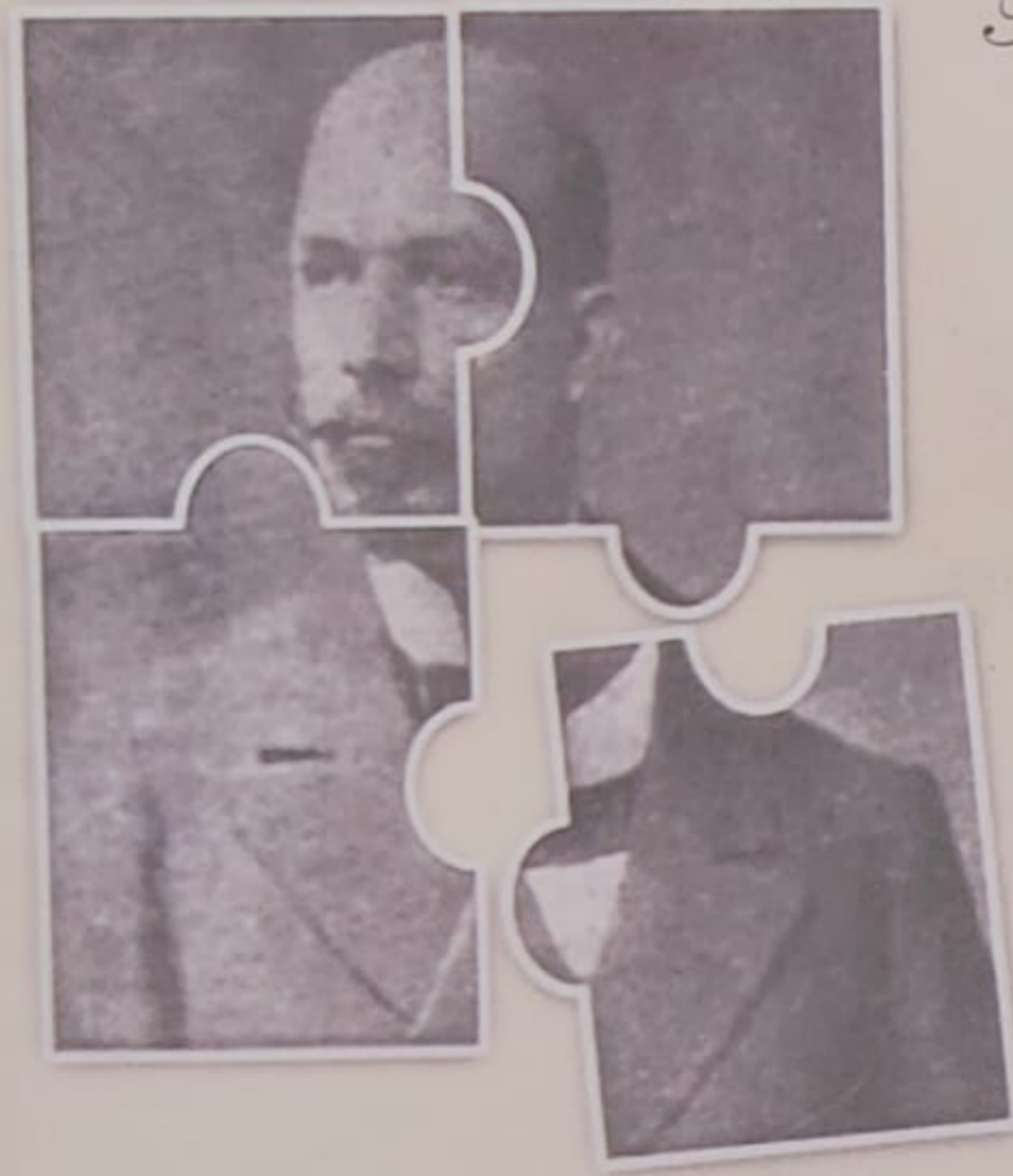
Father of Forensic Dentistry Dr Orar Amoêdo U Valdes (1863-1945)

This memento is presented as a token of appreciation to