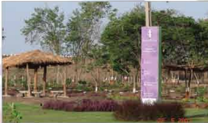
Sarla Kamdar Rotary Park - Rajkot (2006-2007)