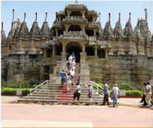
Jain Temples at ◀ Ranakpur