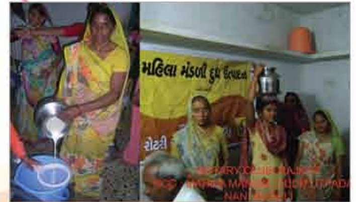
Mahila Dudh Mandli - Nani Amreli (2009-2010)