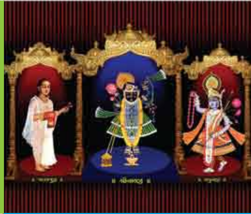
Grace of ◀ Nathdwara