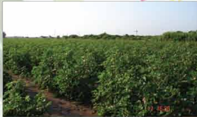
Organic Farming (2007-2008)