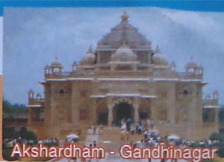
Akshardham - Gandhinagar

To commemorate the glorious occasion a colourful, scientific, educative, informative and elegant souvenir will be published. The organising committee invites scientific papers from the fraternity in original neatly typed. If possible in DIGITAL format with passport size photo of the author as per guideline is included so as to reach the Council office latest by 15th December-2011 . Publishing an article in to Souvenir, decision of Scientific Committee & Souvenir Committee will be final. No communication in that regard will be entertained.