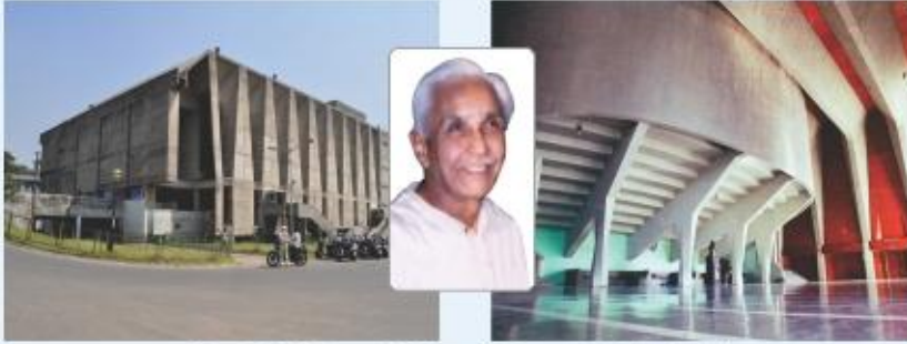
"Dr. R. K. Desai Nagar" Tagore Hall, Paldi, Opp. NID, Ahmedabad, Gujarat