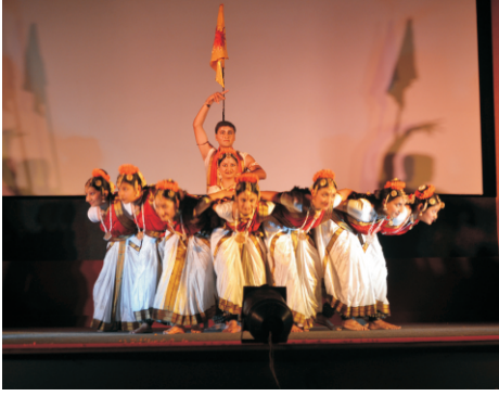
Dancers of "Nriya Bhaarati School of Performing Arts" performing on the occasion of the conference.