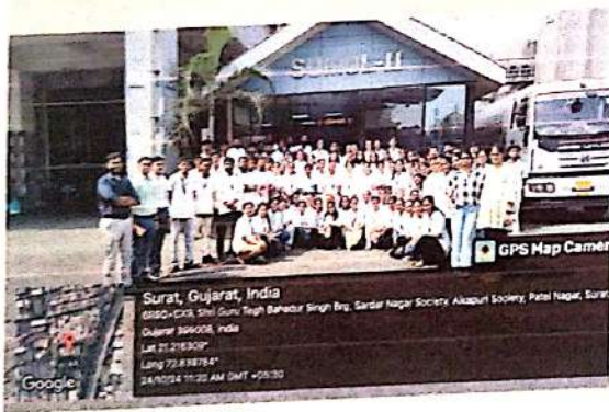
SUMUL DAIRY - SURAT