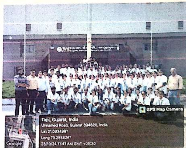
BAJIPURA - DAN FACTORY

Head of Department Community of Medicine CNKHM&RC, Vyara.